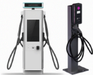
Curated Hardware Catalog

Access everything needed to migrate your network with a single partner, plus tap into industry-leading technology that evolves with you.