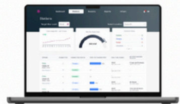
Performance Software Platform